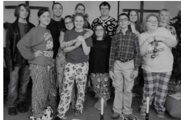
Youth dressed for "The 12 Symbols of Christmas"