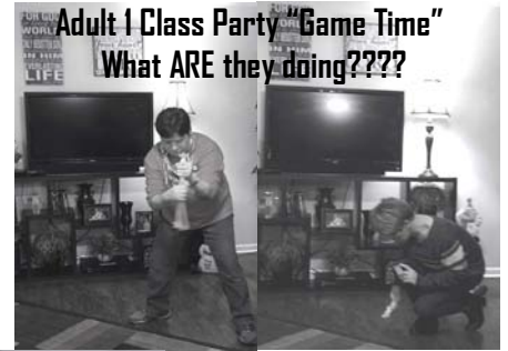
Adult 1 Class Party "Game Time" What ARE they doing????