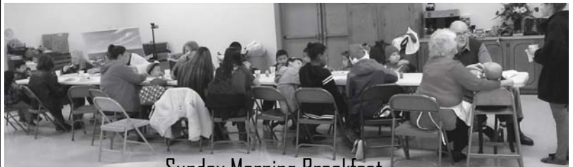
Sunday Morning Breakfast