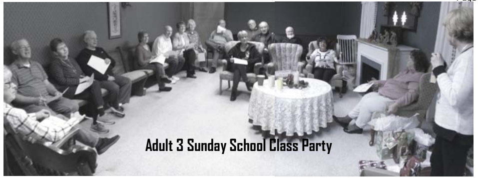
Adult 3 Sunday School Class Party