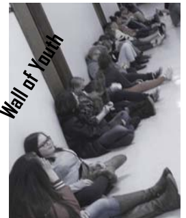
Wall of Youth